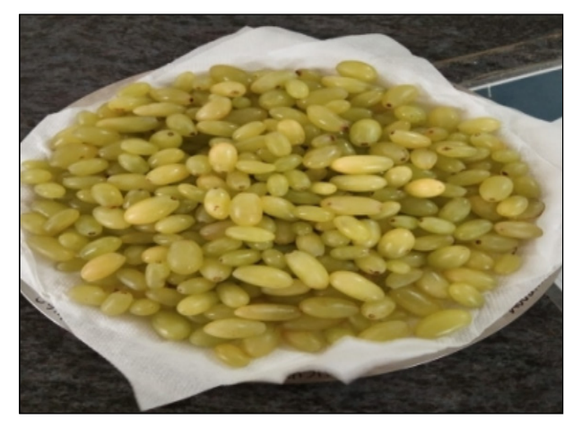
Plate 1: Fresh grapes after cleaning

Green grapes were washed thoroughly in tap water to remove pesticides like carbaryl, pyre thin etc that were spread on grapes to protect it from pests and other organisms those cause damage to the fruit. After thorough washing of the grapes, they were dried by the help of tissue paper which remove water from the surface of the grapes.