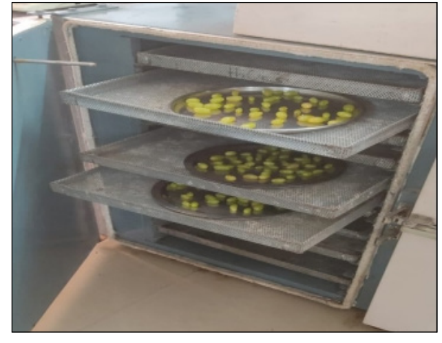
Plate 5: Grapes were kept inside the tray dryer for drying for 8h

and 70°Bx. The tray dryer was pre-heated to reach the temperature of 60°C and then these 4 trays were kept inside it (Plate 5).