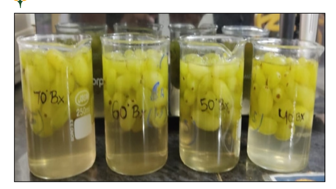
Plate 4: Grapes were dipped in the prepared solutions of 40^{\circ} , 50^{\circ} , 60^{\circ} and 70^{\circ} Bx

These were kept aside for 41 hour for the process of osmosis. Grapes were placed in sugar solution i.e., hypertonic solution due to which exosmosis occurred in which outward movement of the water molecules from the lower solute concentration to higher solute concentrations takes place through grapes covering resulted in shrinkage.